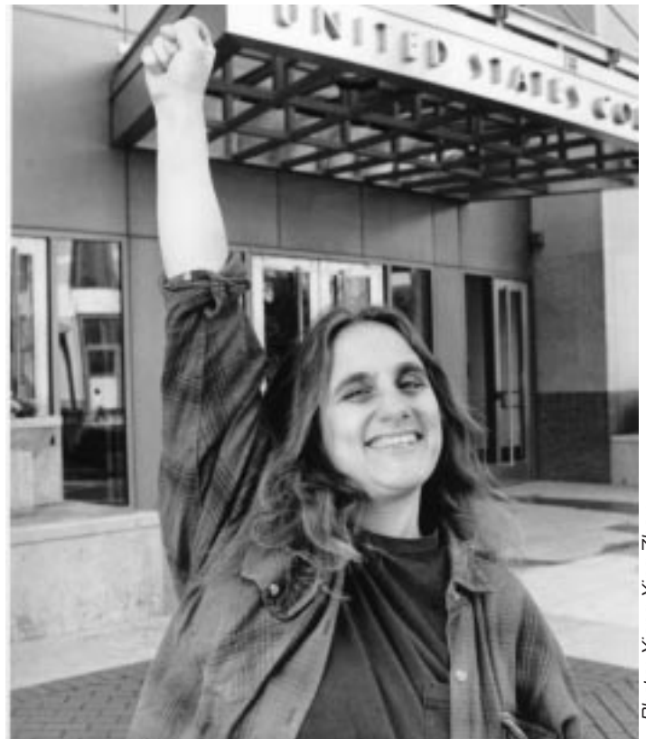
Judi Bari at the Oakland Federal Courthouse, March 1995

MINNEHAHA FREE STATE in Minneapolis, Minnesota, is an occupation by a community-based alliance of Earth First!, the American Indian Movement, and local residents protesting the razing of a neighborhood forested park and Native sacred sites to make way for an unpopular highway reroute. The repression has been intense, including the use of infiltrators, teargas, smearing pepper "gel" directly into the eyes, noses and mouths of activists, and beating activists who were already handcuffed. In December, 1998, this peaceful occupation was raided by over 800 riot police who beat protesters, bulldozed the encampment, and declared martial law. Despite this overwhelming and prolonged assault, activists in Minnehaha, stronger and more unified than ever, continue to hold back the development.