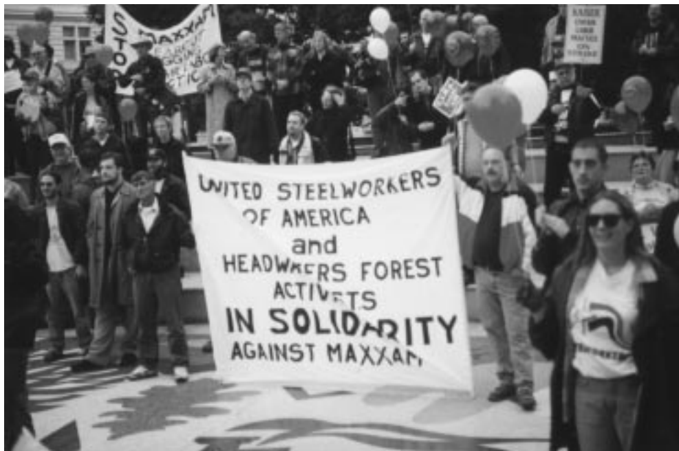
Steelworker/Headwaters Rally, Oakland, CA 12.2.98

Not long after, in the fall of 1997, the nation was outraged by video footage of the calculated and systematic torture of nonviolent protesters in Headwaters Forest, with sheriff deputies applying